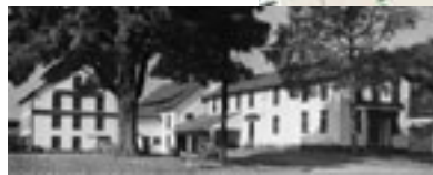
Comstock Ferre, & Co.