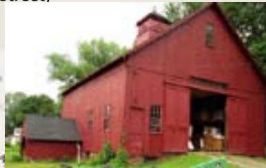
Anderson Farms on Broad Street Green