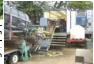
FWG grows, harvests, and processes wholesale green beans in huge quantities, while diversifying into grain corn and a plethora of vegetables for their farm stand and CSA customers.

The Meadows is a special place for birds and bird lovers. In the sky an immature eagle and a red tail hawk soar; in a pool left by rains or receding flood waters, a snipe wades; a kestrel chick plucked from the box on the post awaits a band.