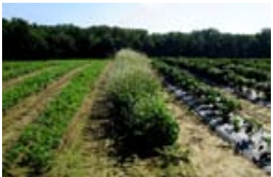
Fair Weather Growers. A row of radishes in bloom attracts bees to pollinate Fair Weather Acres peppers. Carrots, too, are destined for FSA's CSA customers.