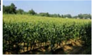
Anderson Farms. Spinach: planted in October, ready to eat in May. Spring plowing. Sweet corn tassels spreading pollen on the wind.