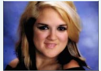
Police seek search warrants in death of Newtown teen