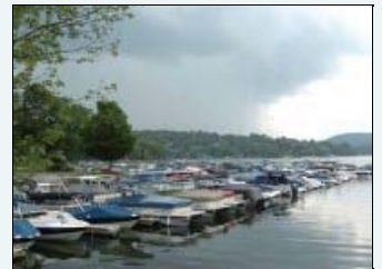
Town leaders want patrols back on Candlewood Lake