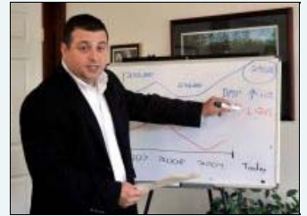
Estate planning is for everybody