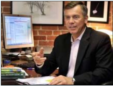
Life insurance a good move, even if you're young