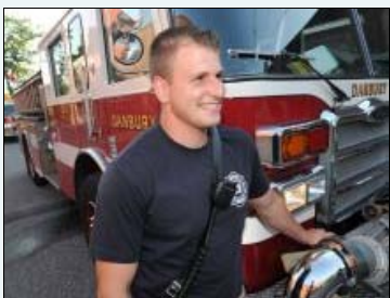
It's never too early to get a will